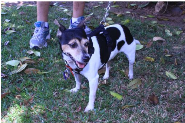
Sandy (from Central Zone)