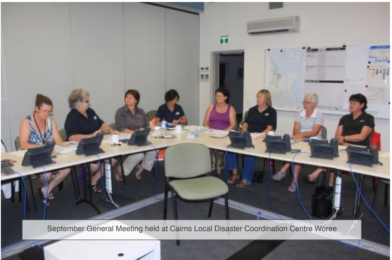
September General Meeting held at Cairns Local Disaster Coordination Centre Woree