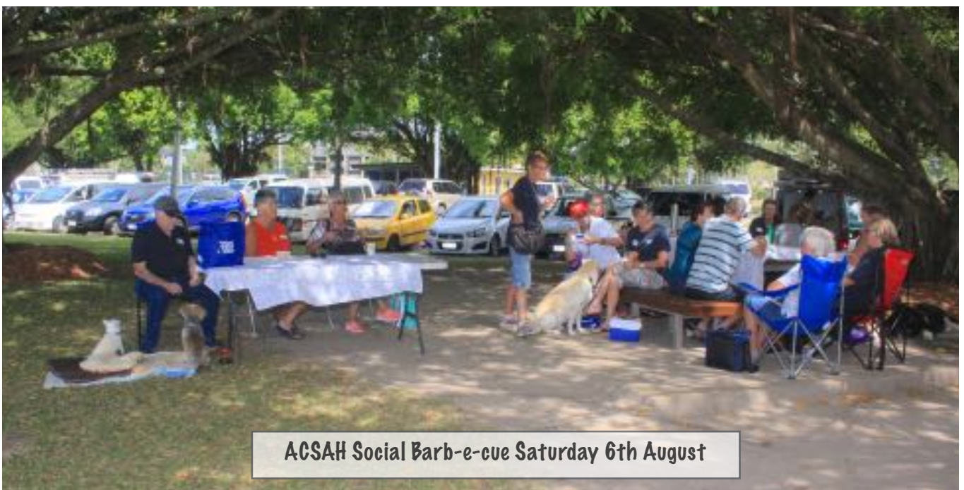
ACSAH Social Barb-e-cue Saturday 6th August

Pet Assist Volunteers - if your First Aid Certificate or CPR is due for renewal please contact your Zone Coordinator to arrange renewal.